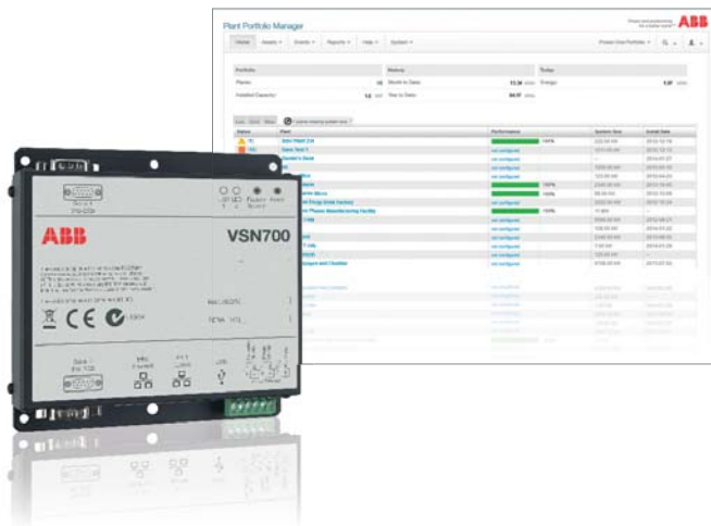
VSN700 Data Logger and web user interface